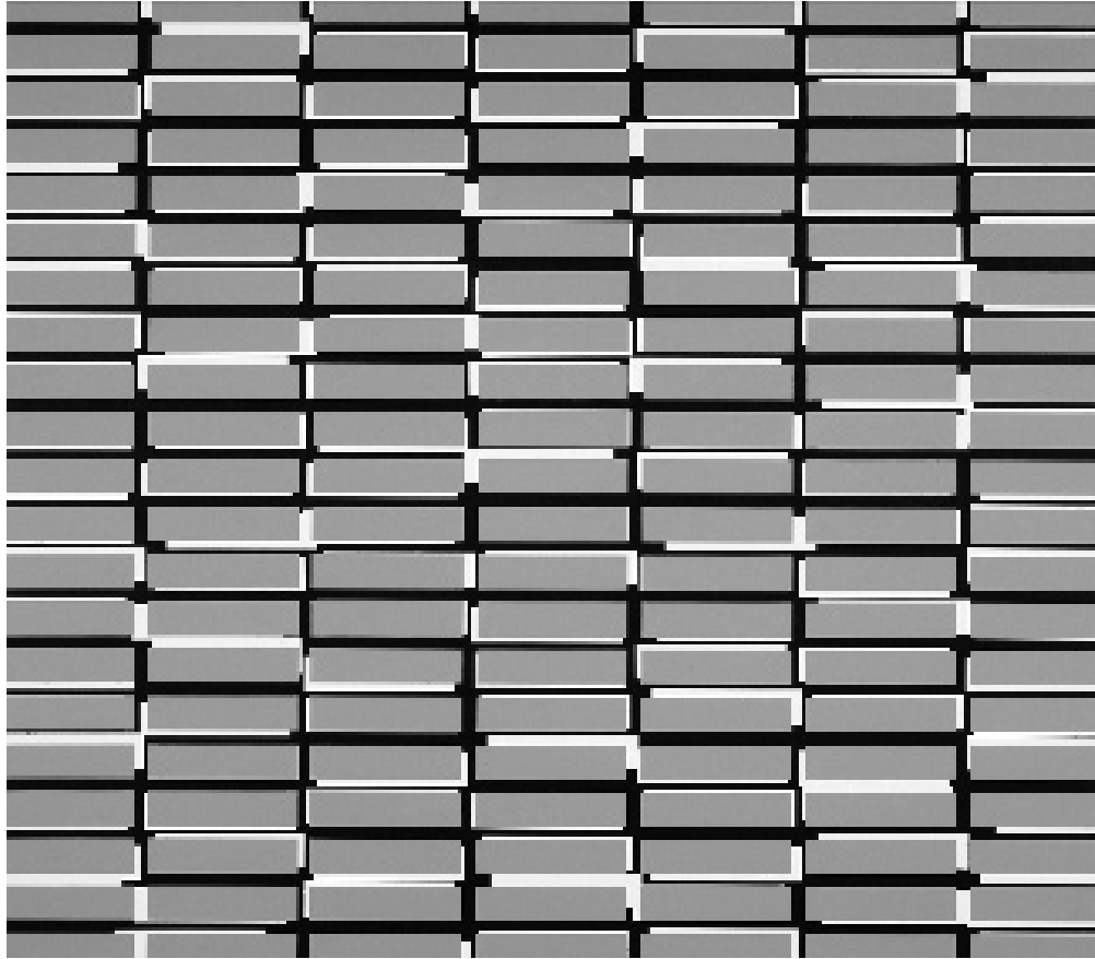
OT Acrylic on cotton, 140 × 160 cm (Esther Stocker, 2007)