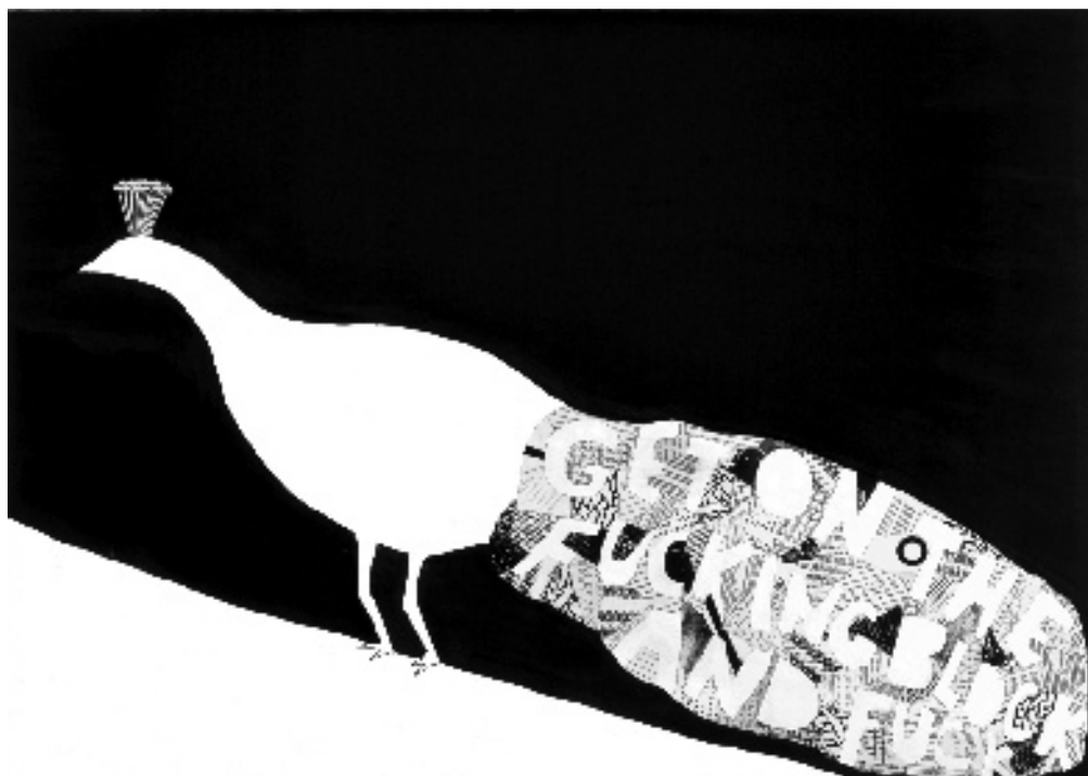
Reflection for Reading Vinyl paint, collage on panel, 91.4 × 157.5 cm (Frances Stark, 2005)